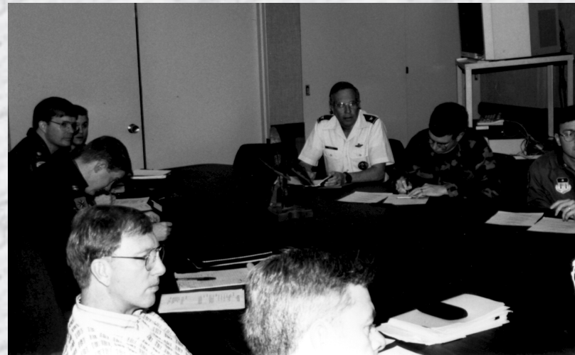
Setting up a board at the Academy